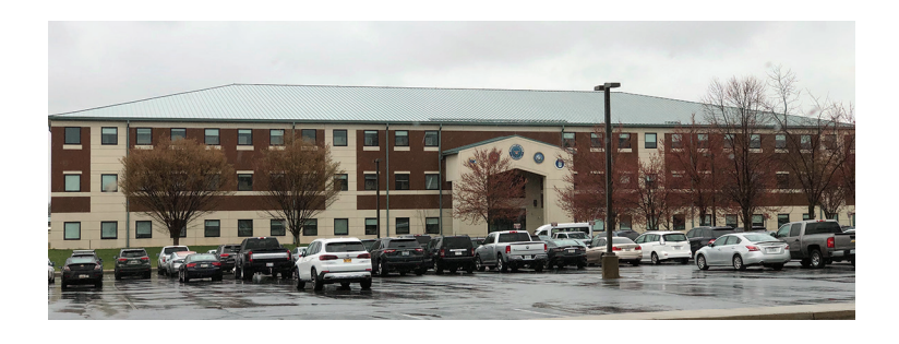
Figure 61-1. The Defense Medical Logistics (MEDLOG) Center on Fort Detrick, Maryland, is home to the Defense Health Agency MEDLOG Directorate (2020).

The Defense Health Agency Medical Logistics Directorate (DHA MEDLOG), formerly known as the Defense Medical Materiel Program Office, located at Fort Detrick, Maryland (Figure 61-1), is a joint activity under the direction, authority, and control of the Defense Health Agency (DHA). Since the DHA MEDLOG's inception, its focus has been medical materiel standardization within the Department of Defense (DOD). The DHA has tasked the MEDLOG with integrating and delivering medical logistics materiel, equipment, and services along the continuum of operational and institutional Military